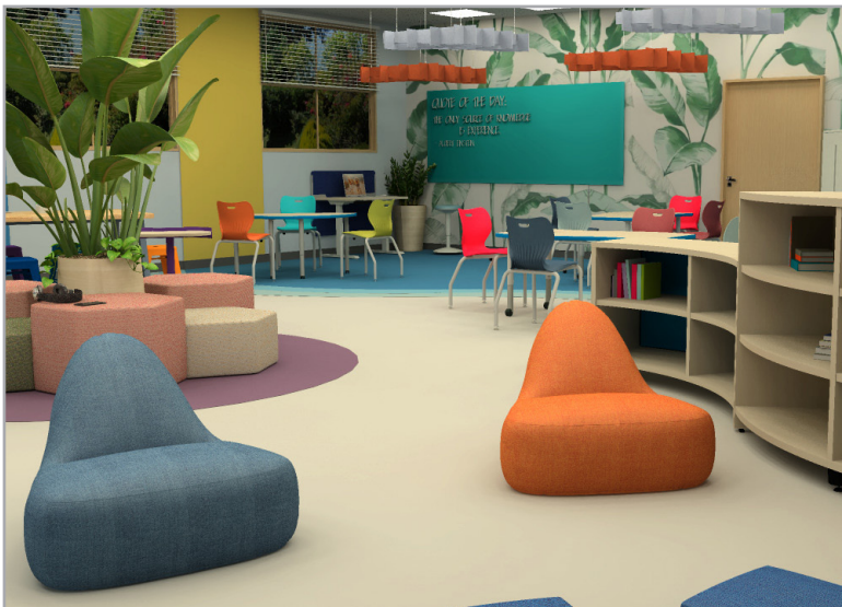
HON Education - Confetti Floor Lounge, Confetti Floor Cushion Single Unit, 42"H Bookcase Curved Out Single Sided, JV Hexagon Pouf, Build Ribbon Top, SmartLink 18" Chair, Arbor Alto Ecoustic hanging Trellis, Clarus - Glassboard, Magnuson - Solna Freestanding Sanitation Station.