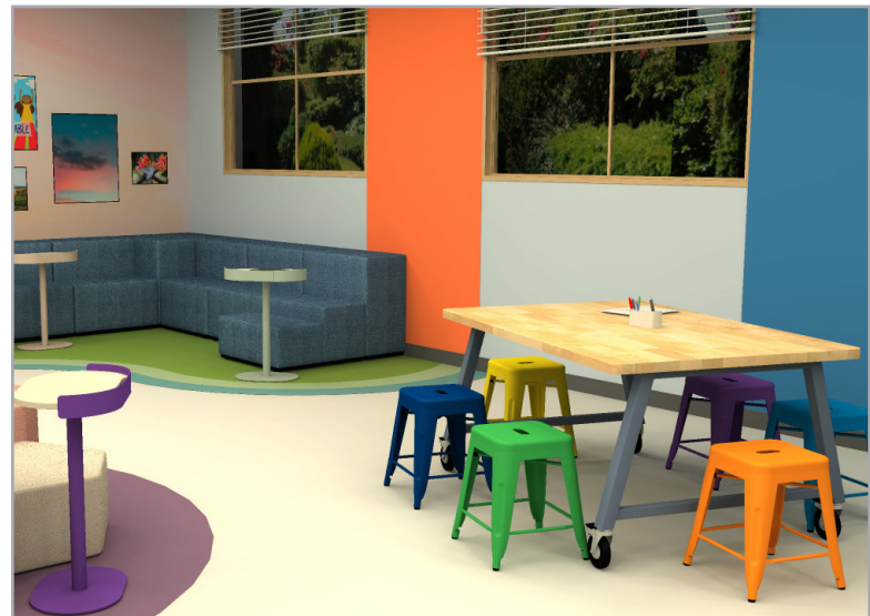
HON Education - Sculpt 28"H Personal Table, Build Seated Height 4-leg Stool, Build Makerspace Table with Butcher Block Top, Tangram - Step, Bench, Perch Flooring Shaw Contract - Vitality Collection.