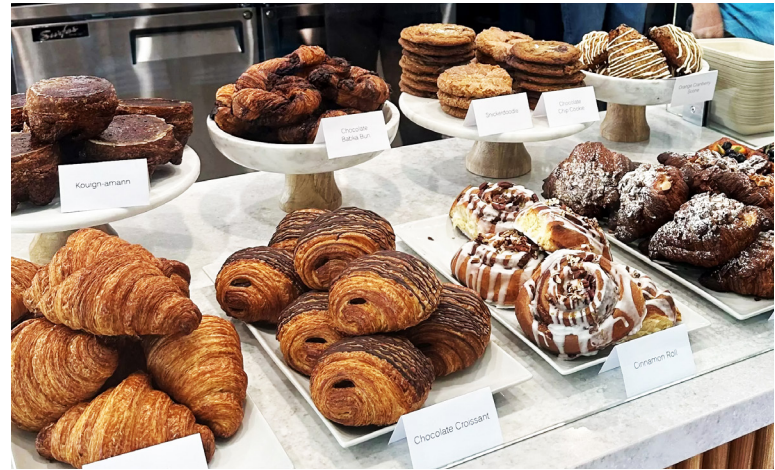
Worth the drive: Scott's Malibu Market (Bakery)

As demolition crews finish debris removal and utility upgrades continue, the promise of summer is tangible. Locals plead, "Don't be afraid to come back" — they need your footsteps and support to sustain their comeback. What you'll find is a community redesigned by resilience, rooted in connection, and ready to welcome you back — with parking, brunch patios, bookstores, and tasting bars open once again.