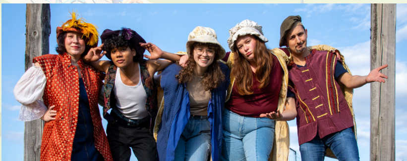
Cast of Backyard Bard, Photo: Ken Holmes

Shakespeare in the Park is a summer must. No tickets needed—just locate a park, a performance time, show up and enjoy!