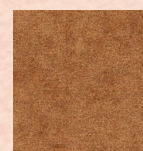
Premier - Nutmeg CF Stinson