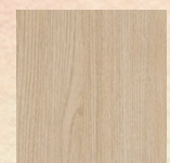
Northern Ash Teknion