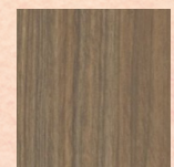
Mercurial Walnut Teknion