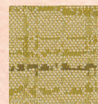
Dappled Sunlight - Geoglyph Luum