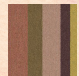
Golden Hour - Forward Motion Luum