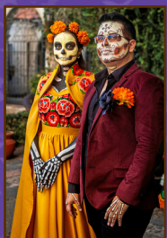
Dia de Los Muertos, Nov. 1