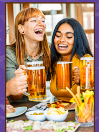
Oktoberfest, Oct. 1 - Nov. 9

November 1 Dia de los Muertos Hollywood Forever Los Angeles, CA