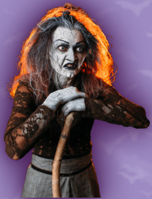
Halloween After Hours Seattle Aquarium

October 1 - Nov 2 Georgetown Morgue Haunted Morgue Seattle, WA