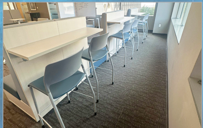
AIS Hakr - lounge chair with tablet, Pierce stool, LB Lounge - 2 and 3 seater with ledge, LB Ottoman, Sit-to-stand pneumatic mobile desk, laptop table.